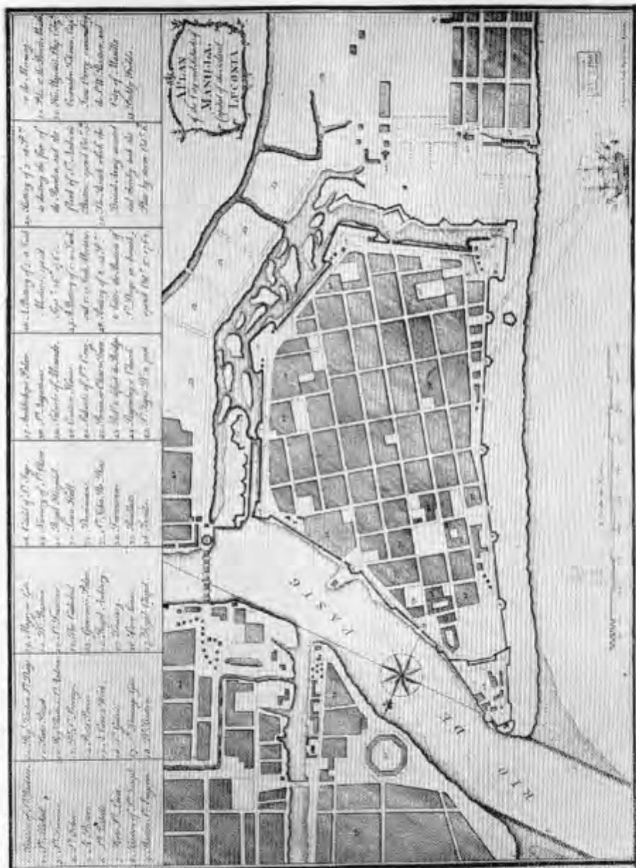
III. Portion of William Nicholson's "Draught of the Great Bay of Manila" showing the Walled City at the Time of the British Attack.