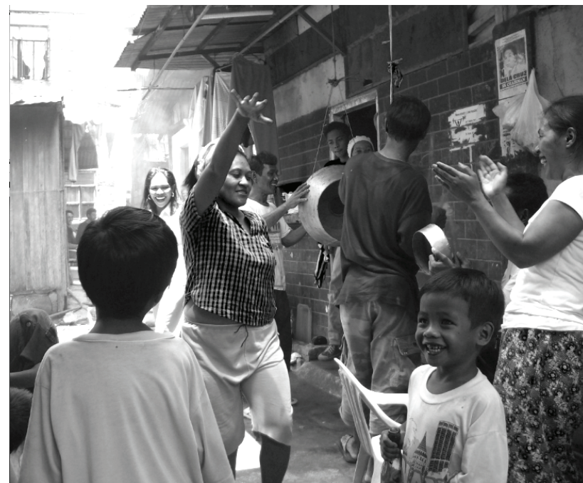
Fig. 5. Entertainment during a wedding preparation, 2 June 2006