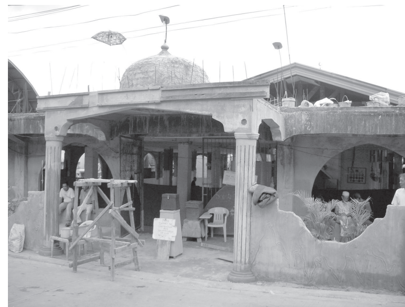
Fig. 2. Salam Mosque, 4 November 2005

Student members of the BYSA and AFFI who lived on the compound played active roles in their community. 23 While doing door-to-door solicitations for the rallies, they tried to organize students and out-of-school youth in the community. Accordingly two informal associations, Kampilan , were