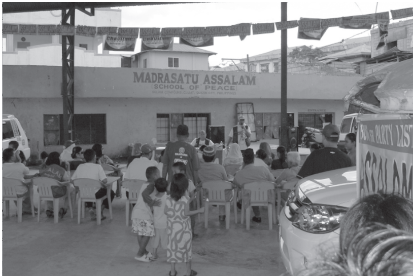
Fig. 3. Political meeting in the Salam Mosque Compound, 27 April 2006

INK, but these write-ups did not last. The national newspapers treated the issue as a land dispute between the two parties. Still, the media attention was fortunate for the Muslims, considering the political and economic influence of the INK, said a Muslim journalist who followed the issue (Usman 2005). He expressed the view that Muslims learned to utilize the mass media by voluntarily supplying the media with information and allowing them to become their spokesmen. Another executive officer of the MYSA told me that only the Muslim students in Manila, who had obtained advanced education in the capital city, could speak English and Tagalog fluently and succeed in drawing attention from the rest of Philippine society by holding press conferences; Muslims who lived in the province and did not receive higher education could not do the same (Gutoc-Tomawis 2005).