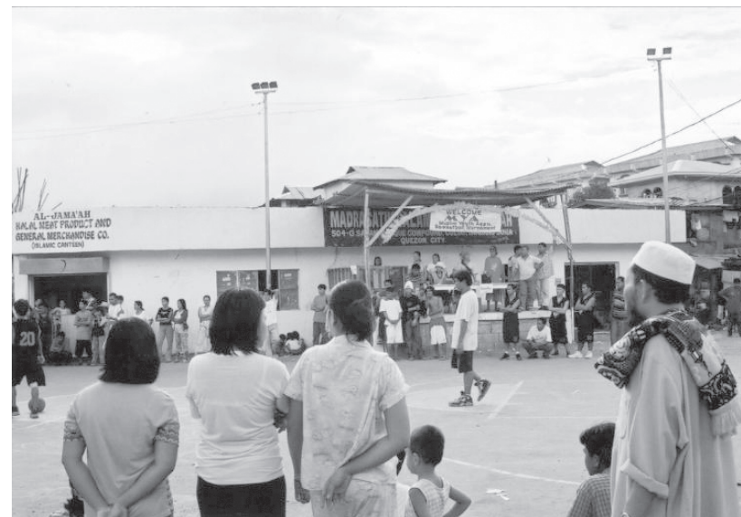
Fig. 4. Man watching basketball game after praying at the mosque, c. 2002

The uniqueness of this strategic essentialism is that it emerged in immigrant Metro Manila. It turned their struggle into a hybrid one, taking in