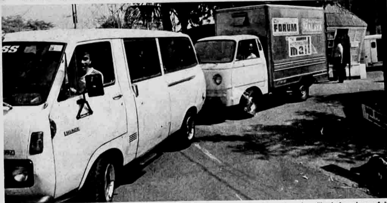
RETURNED. One of the WE Forum-Malaya vehicles is being towed out of the MISG camp in Bago Bantay 777 days after "the little newspaper" was put out of circulation and exactly 57 days after the Supreme Court decreed as illegal the seizure of WE Forum's facilities.