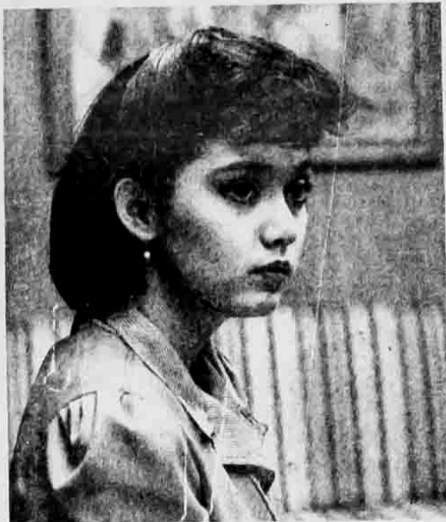
Maricel Soriano: Naghihimala

makasariling hangarin. Na madaling maunawaan naman dahil totoong kayrami pang prodyuser ngayon na nagprodyus ng pelikula para pagbigyan lamang ang ilusyong mag-artista ng kanilang mga misis o kabit na ikalawa, ikatlo, ikaapat at mga susunod pang numero! Puwede rin namang sabihin para pagbigyan lang ang kanilang kapritsonang magartista. Porke may mga ilusyunadong aktor or aktres na dahil sa kinalakihang pantasyang