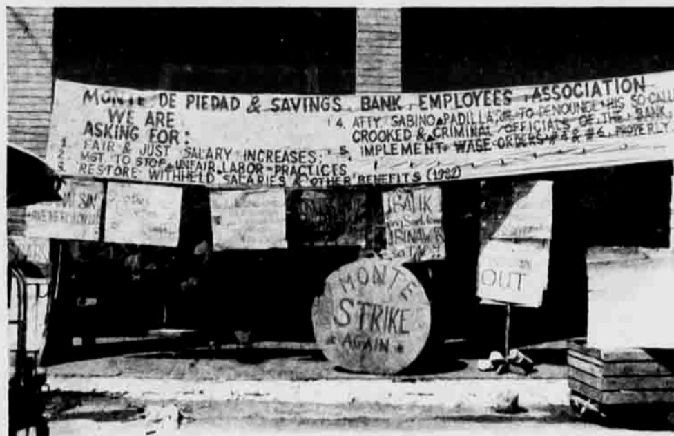
Streamers and placards manned by striking employees of Monte Piedad bank

The Women's Desk hopes to raise the consciousness of Filipinos concerning the status of women; to change the image of women in media; to help better the working conditions of women artists; and to push the women's struggle within the national context.