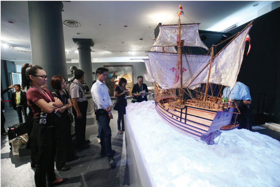
The 'Trinidad' at the Singapore Biennale 2016