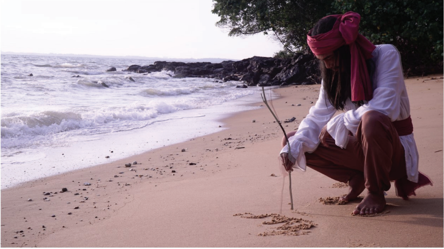
Ahmad Fuad Osman 2016 Still image from the single-channel video