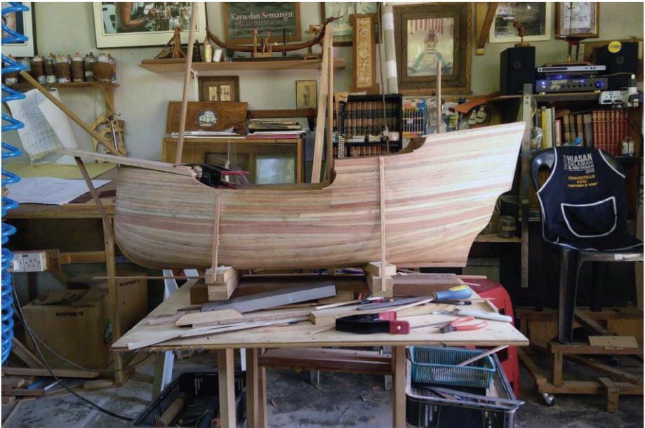
The 'Trinidad' scale model in process in the artist's workshop