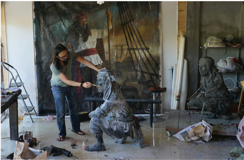
Artist working on the Enrique de Malacca sculpture