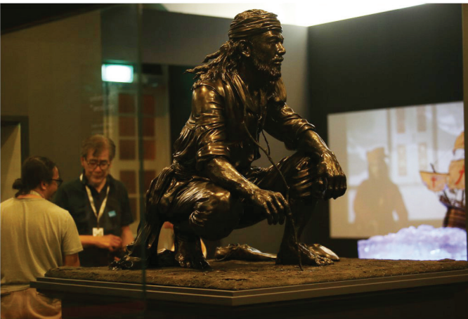
Ahmad Fuad Osman 2016 Sculpture of Enrique de Malacca Bronze finished fiberglass/resin 133 (L) x 133 (W) x 120 cm (H)