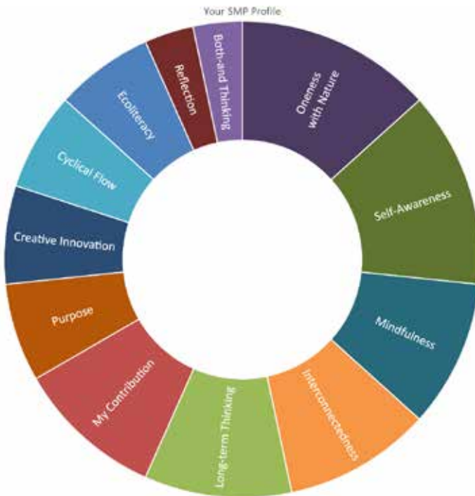
Figure 3: Example of the Sunburst Chart

The purpose of the scoring is two-fold. First, it creates a sunburst chart that shows the participants the current developmental stage of their sustainability mindset for each SMP (see Figure 3). Aligned with the principles of Positive Psychology (Seligman & Csikszentmihalyi, 2014), the graph is not numerical; rather, it shows the relative expression in the SMPs, avoiding judgmental sentiments. Second, the scoring codifies the PR, sending the participant the respective report for this combination of cognitive, behavioral, and affective attributes.