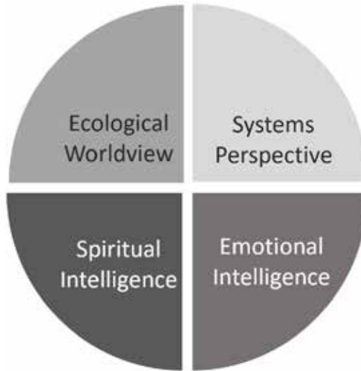
Figure 1: The Four Content Areas of the Sustainability Mindset

grouped into four content areas: ecological worldview, systems perspective, and emotional and spiritual intelligence (see Figure 1).