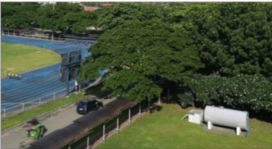
Figure 3: Treated Wastewater Storage for Football Field Irrigation