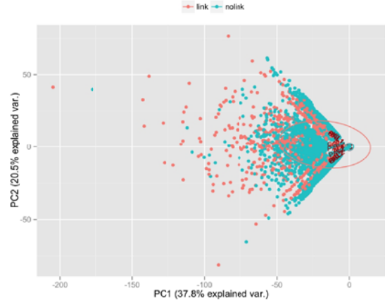
Figure 1. Data visualization of the instances from t=2 , for the VAR and SVM models. Principal Component Analysis was used to project the 13-dimensional points to the 2-coordinate space by using the first two principal components of the instances.

from 2 previous time periods, t-1 and t-2 . However, a visualization of the dataset for the snapshot t=2 , as shown in Figure 1, indicates that this may not necessarily be the case. In this figure, there is no clean linear model that fits the data. However, it should be noted that the two principal components accounted for just 58.3% of the variance in the dataset. We explore SVM to verify if it can improve the time-series prediction.