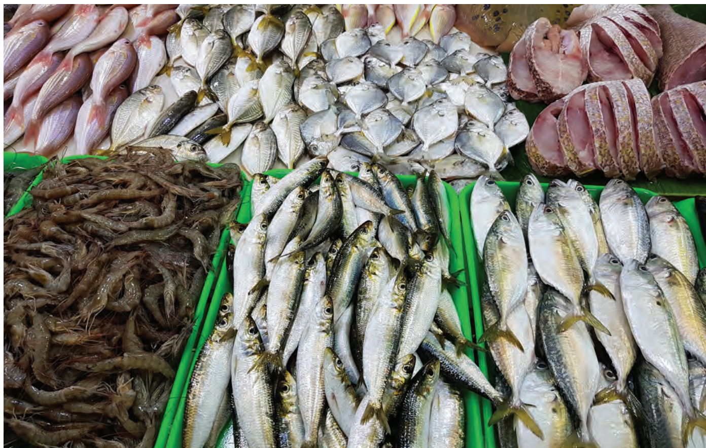
In local public wet markets in the Philippines, wild-captured and aquacultured fish, crustaceans and plants are sold to avid consumers.