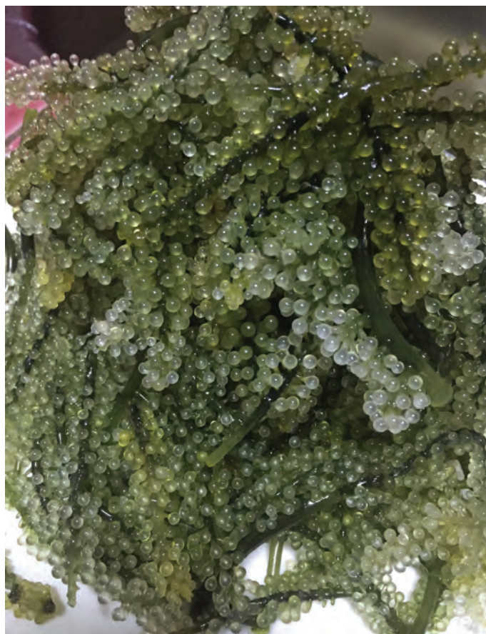
Philippine mariculture is primarily seaweed farming. Caulerpa lentillifera , commonly known as sea grapes, is grown on several seaweed farms in the country.

aquaculture on ecosystems are: 1) the proliferation of invasive species, 2) eutrophication of waters by effluents from the production system, 3) conversion of vulnerable and valuable natural ecosystems for aquaculture use, 4) transmission of diseases and 5) pressure on wild fish populations for production of fishmeal (Diana 2009).