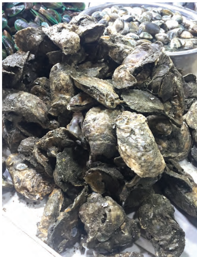
Oysters and mussels account for more than 65 percent of aquaculture production in the Philippines.

Considerable quantities of materials used for aquaculture are imported by the Philippines every year. Shrimp feeds (6,313 t) come from Vietnam (77 percent) and Taiwan (17 percent) were valued at US$65,800 in 2015 (DA-BFAR 2015). That same