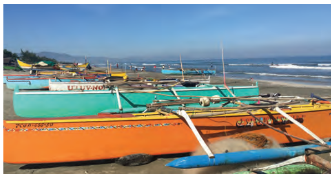
As the Philippines is surrounded by water, fishing villages are common throughout the country. This is a fishing village in the municipality of Binmaley in Pangasinan, which is located at the northern part of the Philippines.