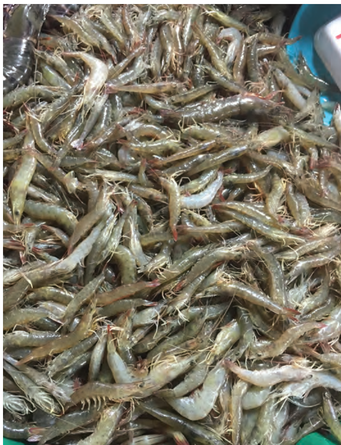
Culture of different species of shrimps has been facing the challenge of production loss due to various diseases.

The degradation of water quality in ecosystems supporting aquaculture is still a major concern in the Philippines, particularly on the island of Luzon. In Taal Lake, concentrations of total dissolved solids, nitrates, and phosphates are significantly greater in samples from aquaculture cage sites than in areas without