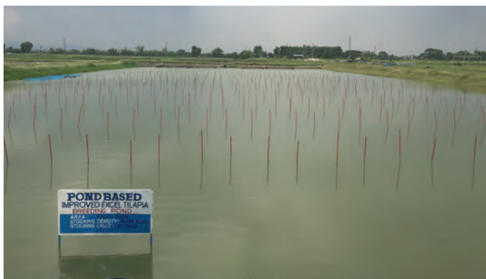
Tilapia production tops all other freshwater systems in the country, making up more than 95 percent of the freshwater fish ponds. This photo shows a breeding pond for the improved Excel tilapia in BFAR, Nueva Ecija, Philippines (Photo: J.A. Ragaza).

area in 2002 (Ferrera et al. 2016). Eutrophication was largely the result of the over-abundance of fish farm structures, at twice the allowable number set by the local government.