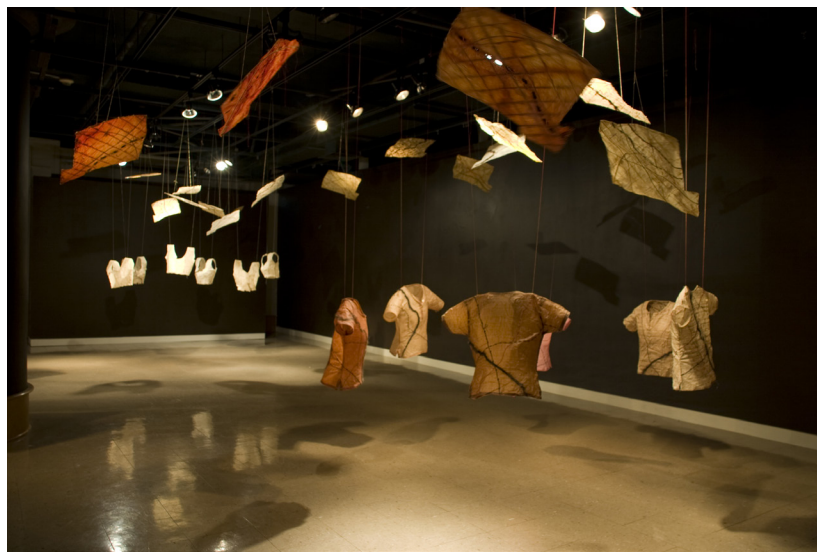
Figure 3. Installation view 3. Remembering the Crooked Line . © Pritika Chowdhry, 2009.

the affective circulation of collective memory by conveying what is left unsaid to audiences: namely, the simultaneous existence of pleasure and violence, life and death, as it is aesthetically re-membered through the partitioned body's trace.